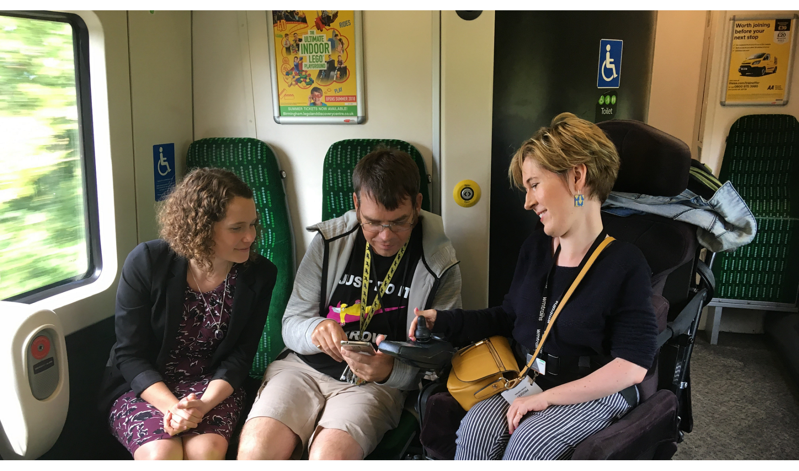
Transreport Passenger Assist has been trialled on West Midlands Railway and London Northwestern Railway services and is due to be rolled out across the rail network from autumn 2019